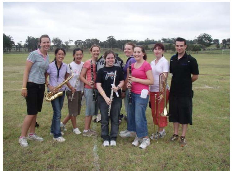
Millennium Marching Band camp