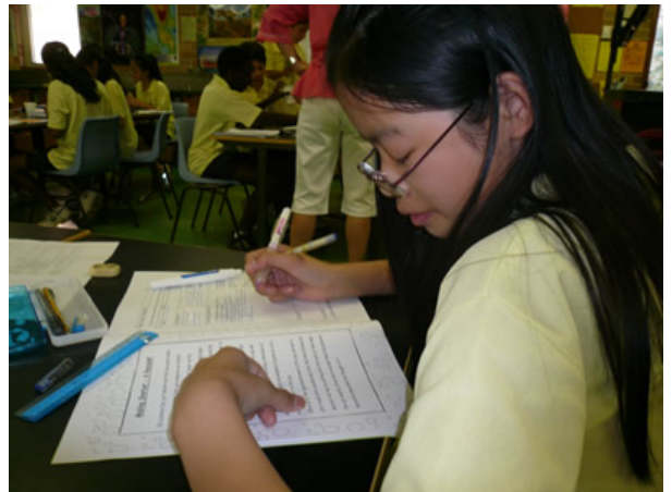
Writing a procedure to make sherbert.

Making sherbet was one of the more enjoyable activities because after you made it you were allowed to eat it. Some students found their sherbet sweet, while others found it sour. After making their sherbet, students were asked to write a procedure.