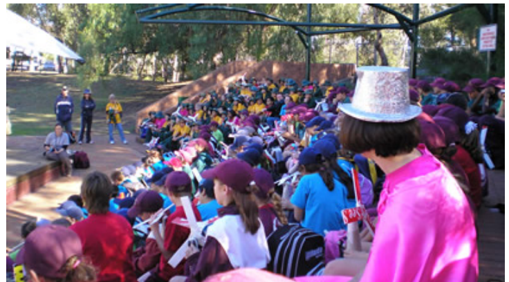
Young students watch with interest