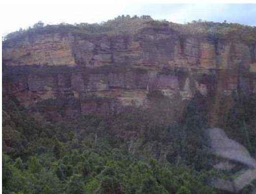
A great mountain view

Overall, it was an excellent educational excursion which we all enjoyed, despite the fact that we had to fill in worksheets all through the day.