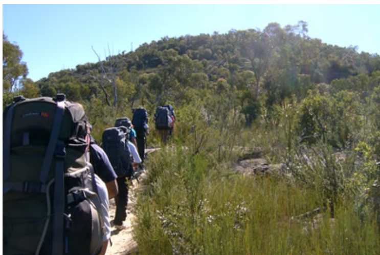
The journey up the mountain proved very hard.

Yes it was a good experience because we learnt how to survive and cope without modern technology like showers, heaters, and other electronic appliances. We had good fun and also we got to miss two days of school. Hehe.