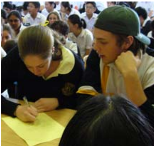
The McKay team hard at work