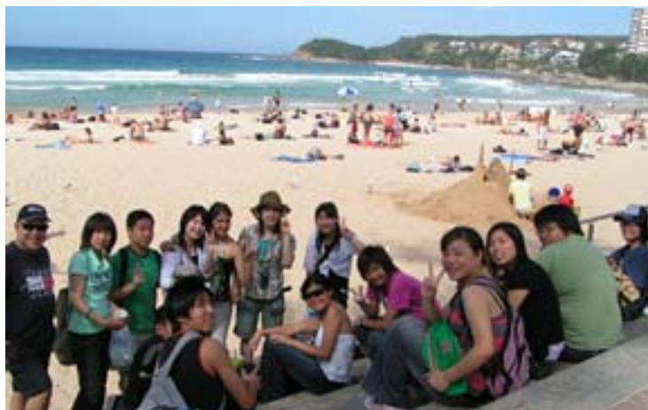
Hisai High and Girraween High students at Manly Beach