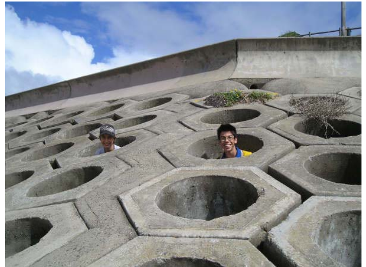
The students found the Seabees very amusing.

Once at Cronulla we saw the sea wall, also constructed to keep out erosion. The sea wall consisted of 'seabees' which were holes within the interlocking hexagonal units that made up the wall which were designed to reduce the velocity of waves.