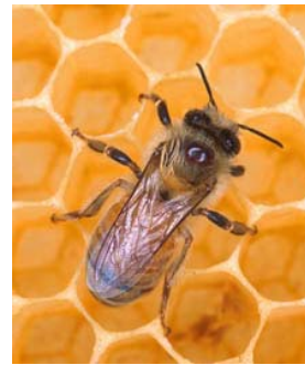
A honey bee

At the end of Term One the honey frames were removed from the Bee hives. The honey will be extracted by several Year 8, 9 and 10 students. This is a lengthy process and we are hoping to have it bottled and for sale very soon.