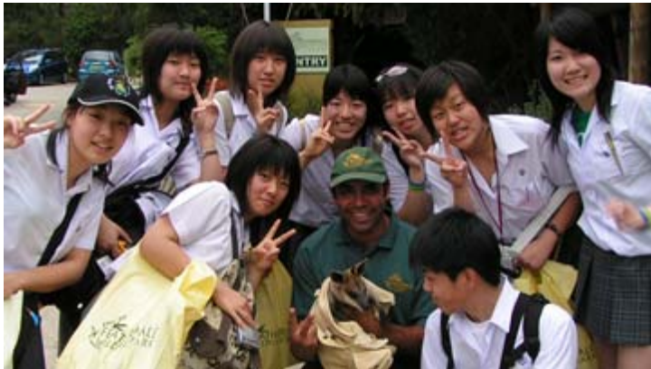
Students from Hisai at Featherdale Wildlife Park

The students were greeted at the airport by their excited host students and attended their first day at an Australian high school the following day. In their two weeks, they were taken to many different places to show the diversity of Australian culture, from patting animals in Featherdale Wildlife Park to climbing the Harbour Bridge.