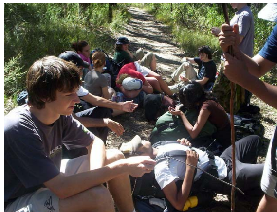
5 km in on the first day and fatigued already – let's go home!

The first two days were fairly unremarkable, as we re-crossed tracks that we've come to know well in Bronze and Silver hikes. We hiked across endless fire trails, down sodden gullies and up perpetual hillsides. The second day was probably the worst. It involved plenty of hiking up vertical inclines, and the midday heat really got us. That particular night was concluded with a lengthy debate on whether the group should travel to Base via the Colo riverbed, or follow what we had originally planned and go back up the mountain and backtrack the ridges and fire trails.