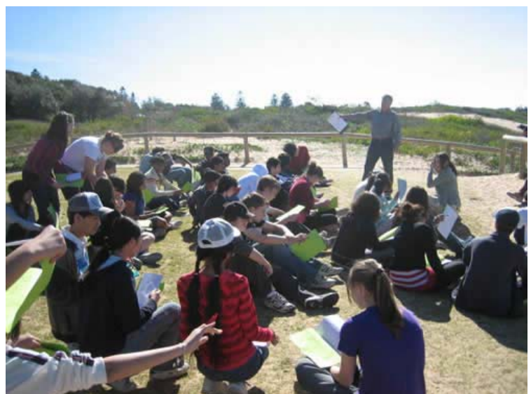
FIELDWORK: exhausted yet hardworking students

Our thanks to our geography teachers for safely leading us through dangerous jungles filled with long, winding tree roots, deep trenches of doom and tree canopies filled with deadly animals. We're lucky to be alive! Well, not exactly, as the only danger was tripping over one of the numerous tree roots, but still, their patience and never-ending supply of facts kept us entertained.